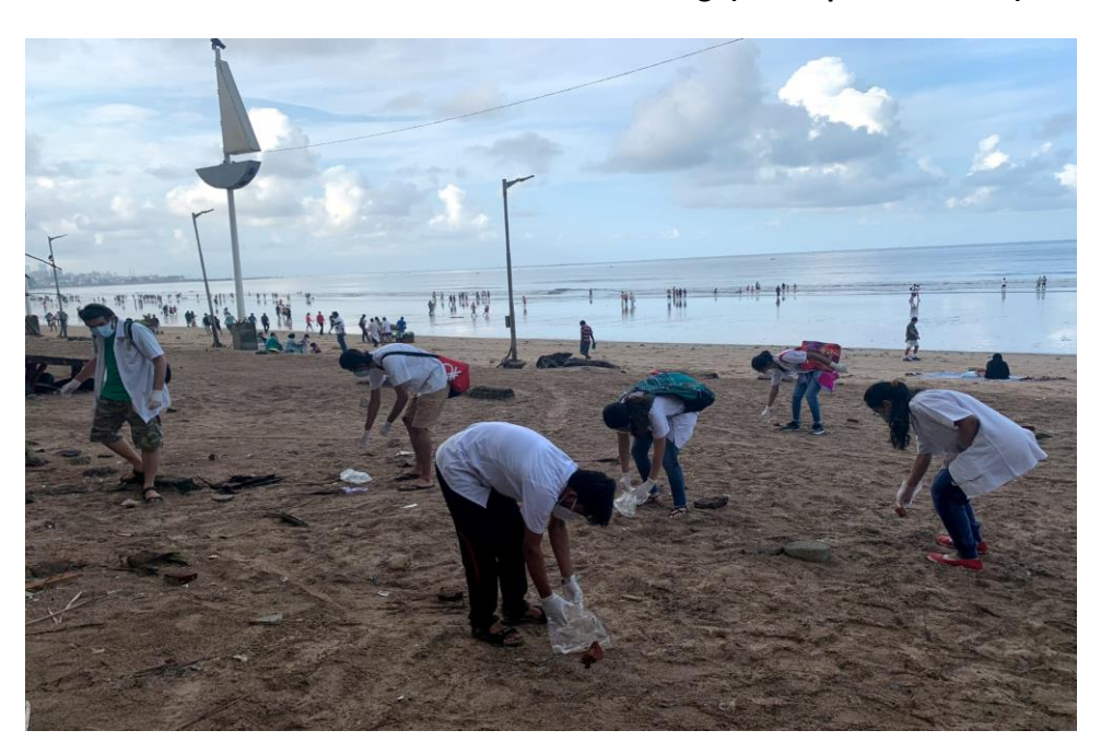
ACTIVITY 4: NSS FOUNDATION DAY- Beach Cleaning (26th September 2021)